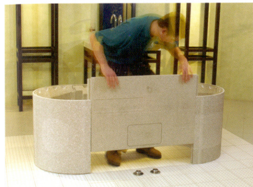
Assembling the support by means of the simple and rapid sliding system.