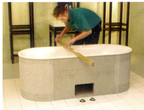
Placing the bath on the support and making sure it is perfectly horizontal. Through the service hatch, the waste/overflow combination can be connected to the waste.