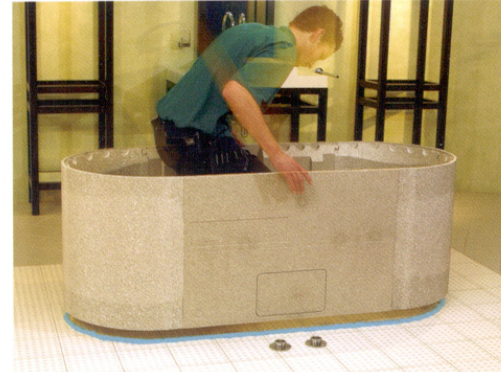
Placing the support on the polyurethane foam and, using a water level, making sure the construction is perfectly horizontal (placing it on an uneven/a not completely flat floor is not a problem).